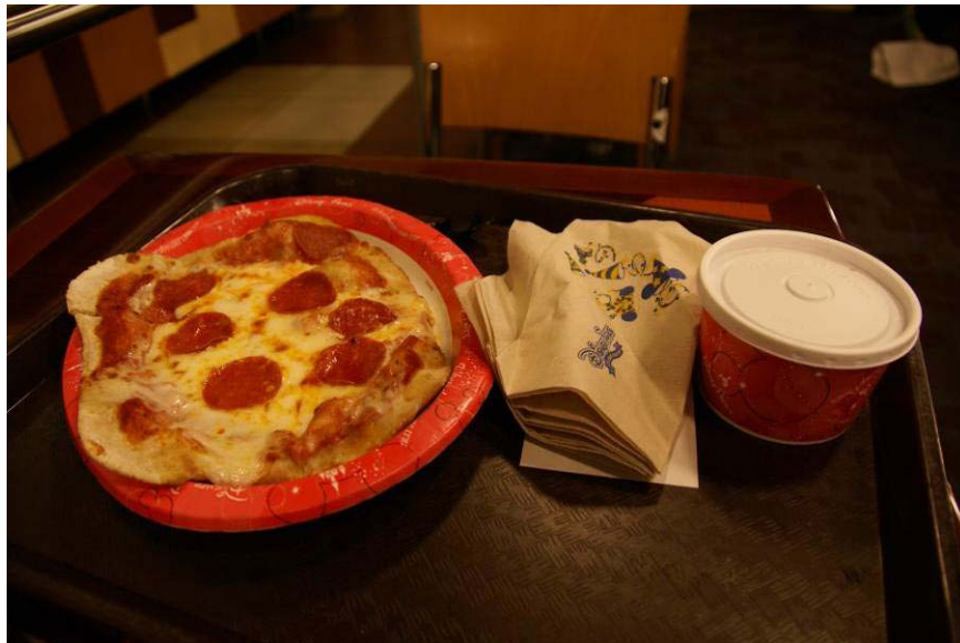
Pepperoni Flatbread Soup of the Day - Minestrone Grapefruit Juice