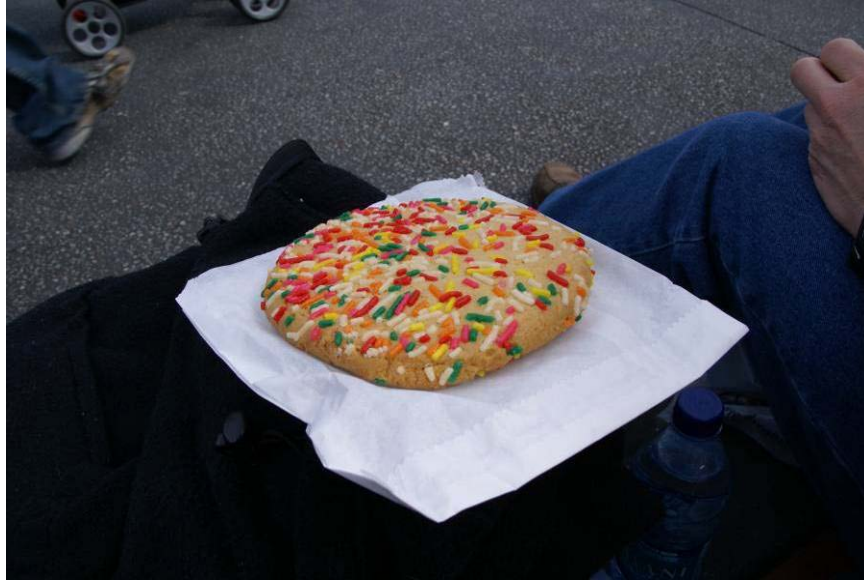
Sugar Cookie Dasani Water bottle

FRIDAY, FEBRUARY 19, 2010, 12PM MAIN STREET BAKERY MAGIC KINGDOM - MAIN STREET, USA SNACK