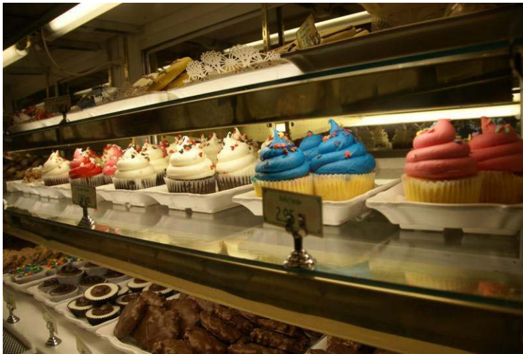
Cupcakes and Pralines*