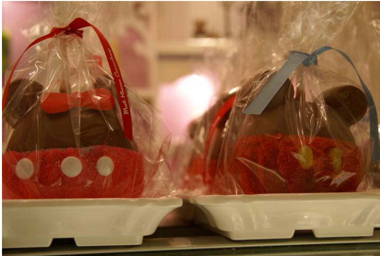
Chocolate-coated Candy Apples*