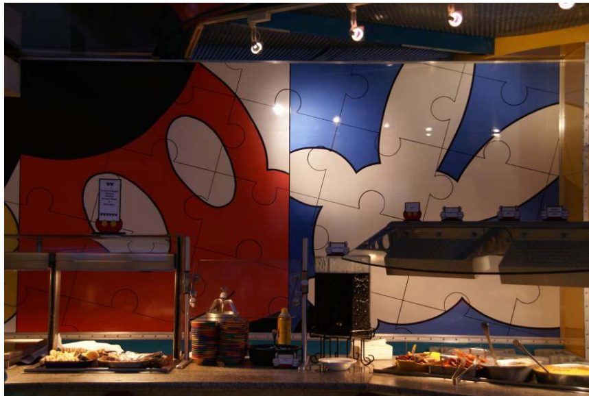
Wall Décor behind Breakfast Buffet