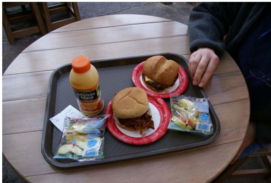
BBQ sandwich with apple slices Beef Angus Cheeseburger with Apple Slices* Dasani Water Orange Juice*