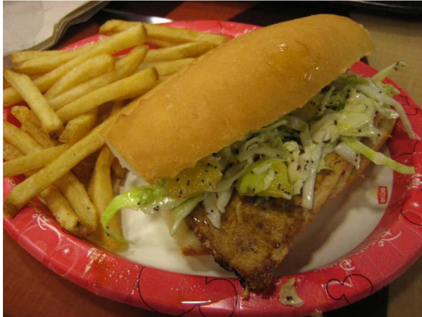
Mahi Sandwich with Fries