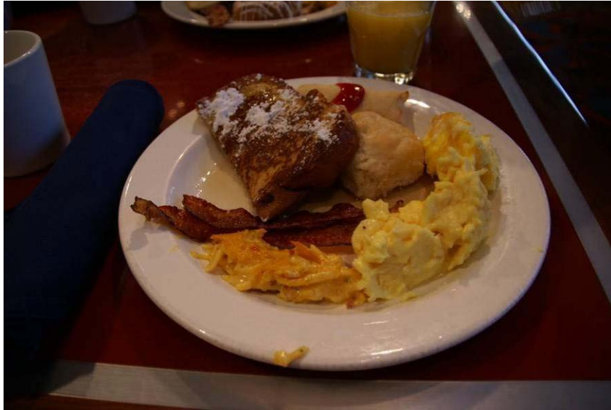
Orange Juice & Coffee, Cheese-covered Scrambled Eggs, Bacon, Cheesy Hash Browns, Biscuit, & French Toast with Syrup