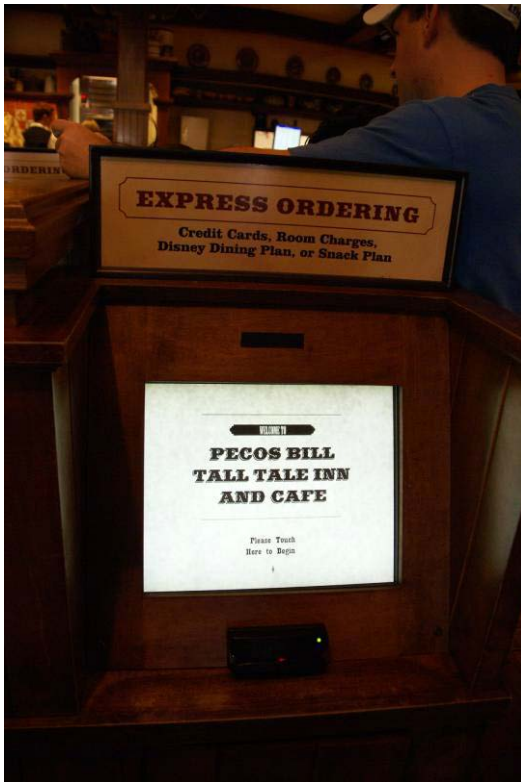
Computerized Meal Ordering Kiosk