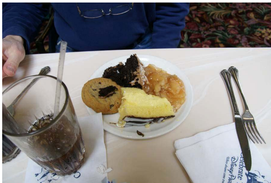
Chocolate Chip Cookie, Chocolate Trifle, Boston Cream Pie, & Apple Cobbler*