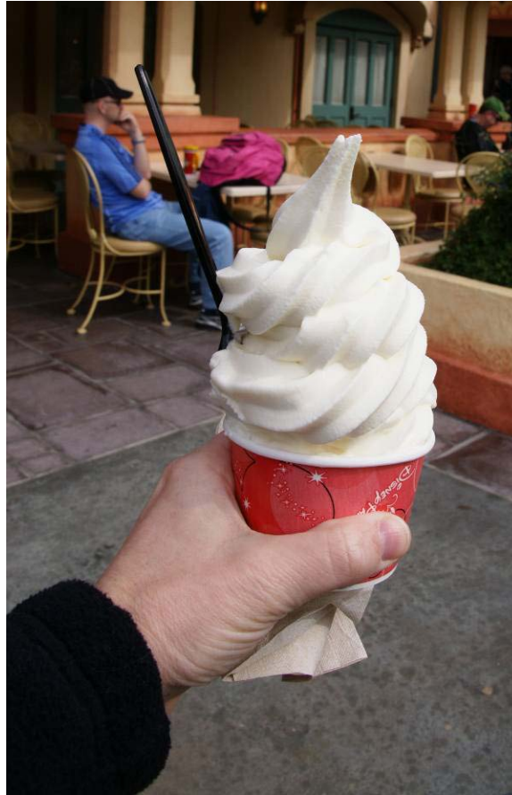
Dole Whip - Vanilla Dasani Water bottle

SATURDAY, FEBRUARY 20, 2010, 12PM ALOHA ISLE MAGIC KINGDOM - ADVENTURELAND SNACK