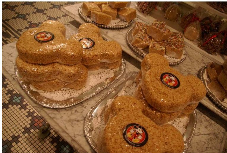
Large Crispied Rice Mickey Head Treats*