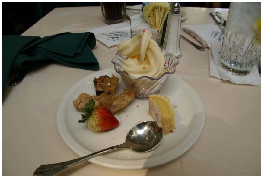
Lemon Square, Apple Cobbler, Strawberries, & Soft Serve Vanilla Ice Cream with Rainbow sprinkles

Chicken Nuggets, Ratatouille, Cheese Pizza Slice, Meatballs, Corn Spoonbread, & Broccoli