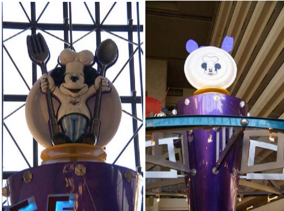
Chef Mickey Signs