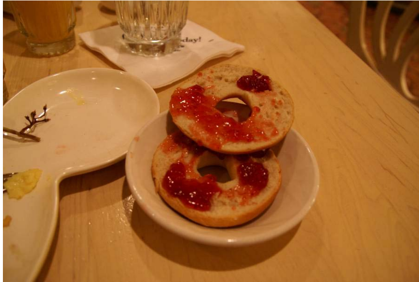
Bagel & Strawberry Preserves