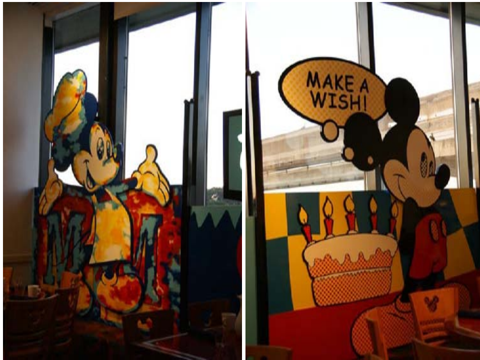
Chef Mickey Wall Decor