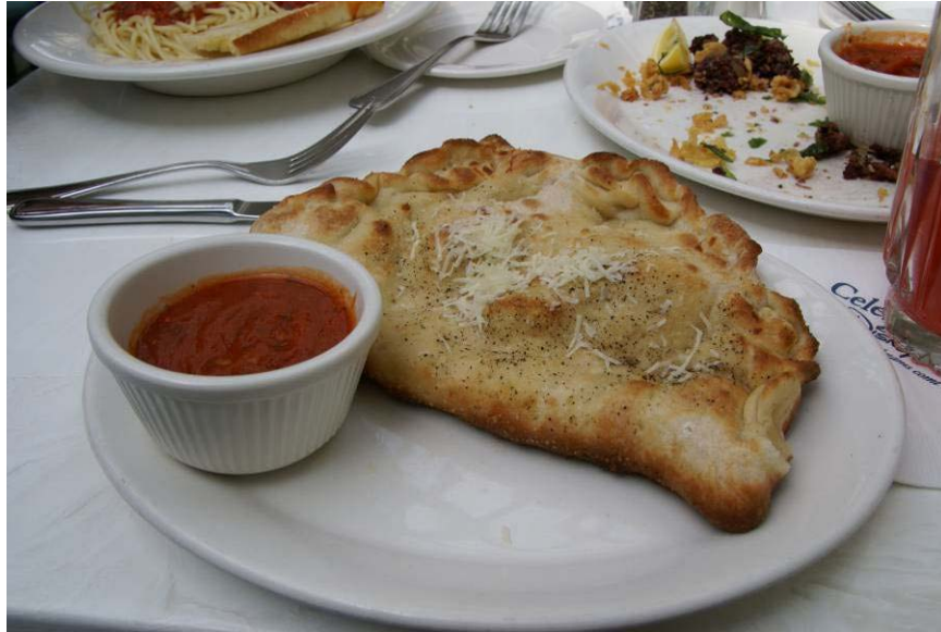
Chicken Spinach Florentine Calzone