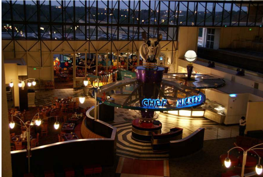
Chef Mickey Restaurant