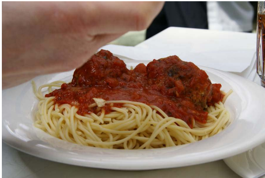
Spaghetti and Meatballs*