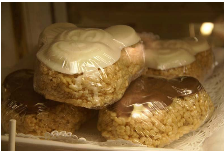
Chocolate-Covered Crispied Rice Treat*