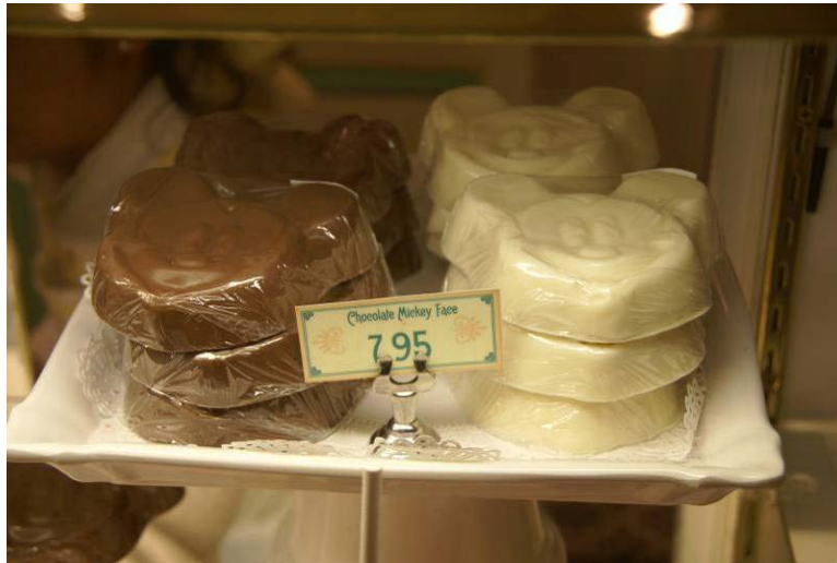
Chocolate Mickey Heads*