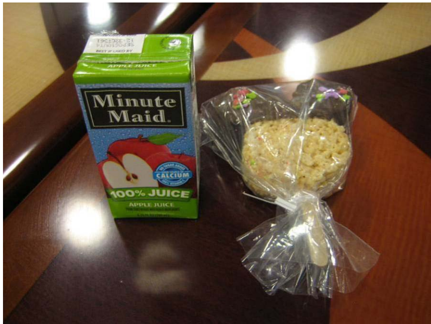
Apple Juice Box & Chocolate-covered Crispied Rice Treat