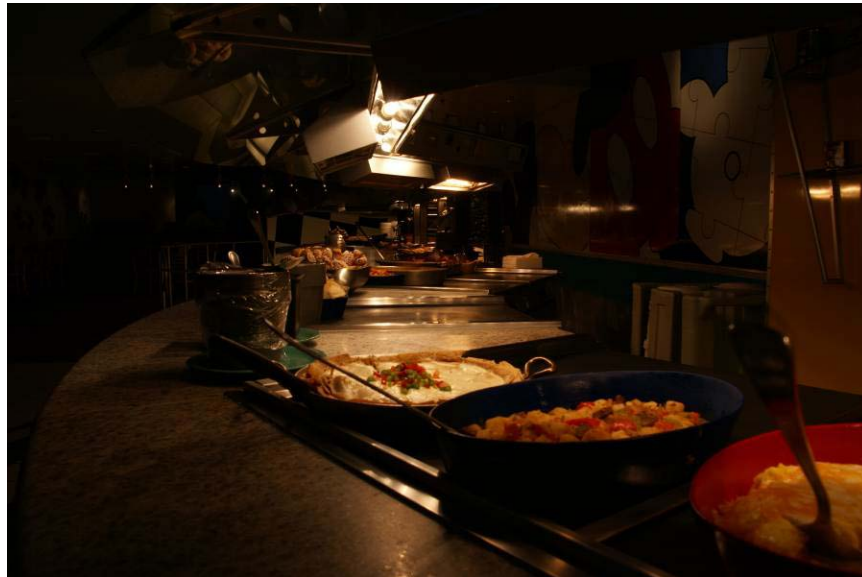
Breakfast Buffet Items