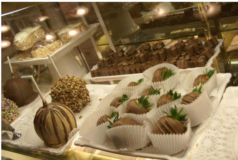
Chocolate-covered Apples, Strawberries, Crispied Rice Treats, & Truffles*